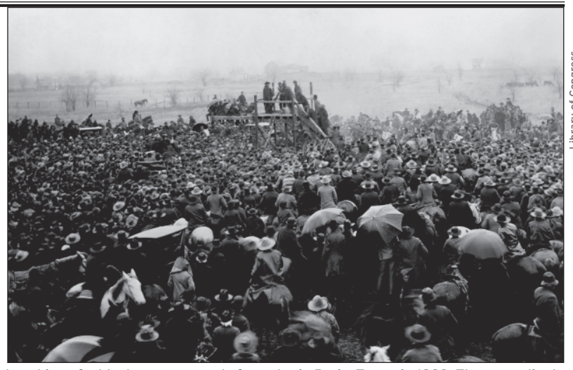
Lynching of a black man accused of murder in Paris, Texas, in 1893. The exceedingly large crowd shows this is a "spectacle lynching."

One important result of her lectures in Britain was the formation of the British Anti-Lynching Committee. Members wrote letters to southern governors and other politicians, pressing them to enact anti-lynching laws or face losing British bank loans and investments. Some southern states did pass such laws, but their enforcement was often weak.