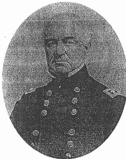
Col. Ethan Allen Hitchcock

Ordering troops to the Rio Grande, into territory inhabited by Mexicans, was clearly a provocation. Taylor's army marched in parallel columns across the open prairie, scouts far ahead and on the flanks, a train of supplies following. Then, along a narrow road, through a belt of thick chaparral, they arrived, March 28, 1846, in cultivated fields and thatched-roof huts hurriedly abandoned by the Mexican occupants, who had fled across the river to the city of Matamoros. Taylor set up camp, began construction of